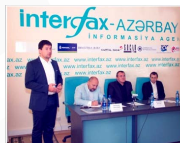
Business centre "Sahibtaj", Baku

The full spectrum of financial services of MFX Group will be presented on Azerbaijan market in 2015.